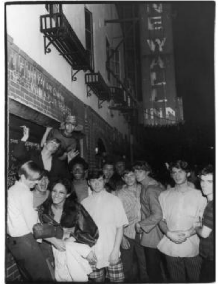
The Stonewall Inn in 1969

For example in the UK male same-sex affection was illegal until 1967 and could have resulted in arrest and imprisonment .