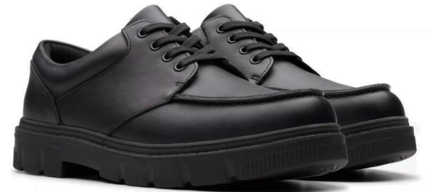
Plain black leather school shoes