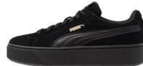
Puma suede trainers