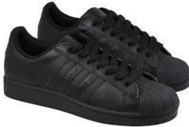
Plain black, polishable trainers