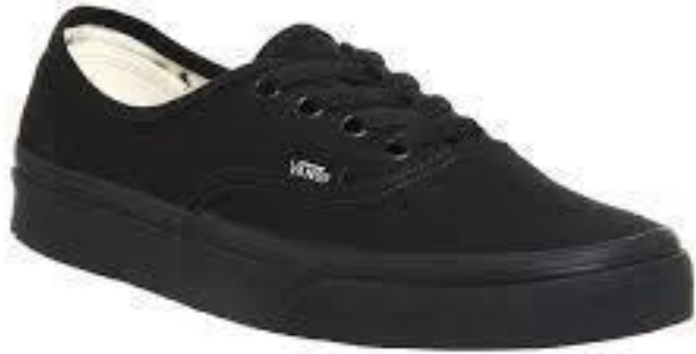
Black canvas Vans