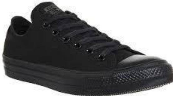
Black canvas Converse