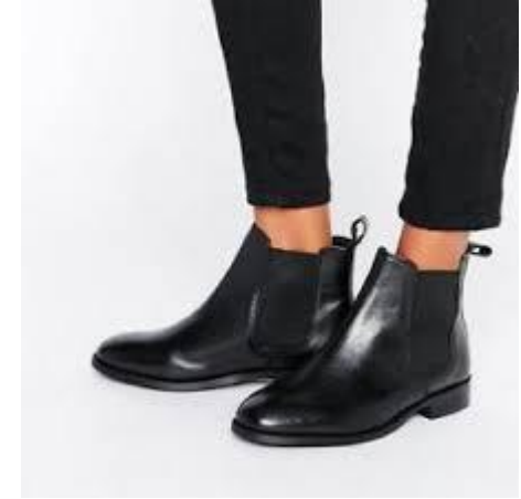
Plain black ankle boots