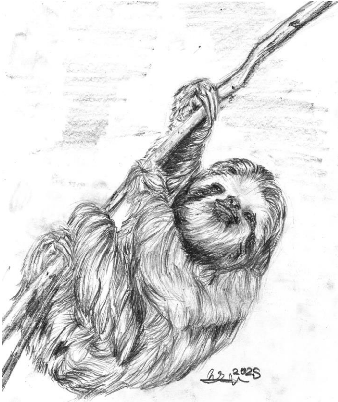
Weronika W - Year 9

Weronika has been attending Y9 Art Club since September and has produced exceptional work throughout. This sloth she created using graded pencils is a brilliant example of her impressive skill level with proportion, detail and shading. We think she has captured the expression perfectly, allowing the character of the sloth to shine through, which is no easy task. Very well done Weronika!